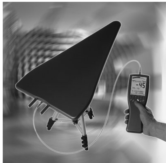
Fig. 2. Spectran HyperLOG Antenna [1].

To explore the radio frequency signatures prevalent in the environment it was decided to use off the shelf components. A Spectran Spectrum analyzer (Figure 2) was employed to detect radiation and their respective signal strengths. The analyzer is manufactured by Aaronia AG. It uses digital signal processing to extract and filter the characteristics of the radio frequencies. It is designed to identify a frequency range of 10MHz to 6GHz.