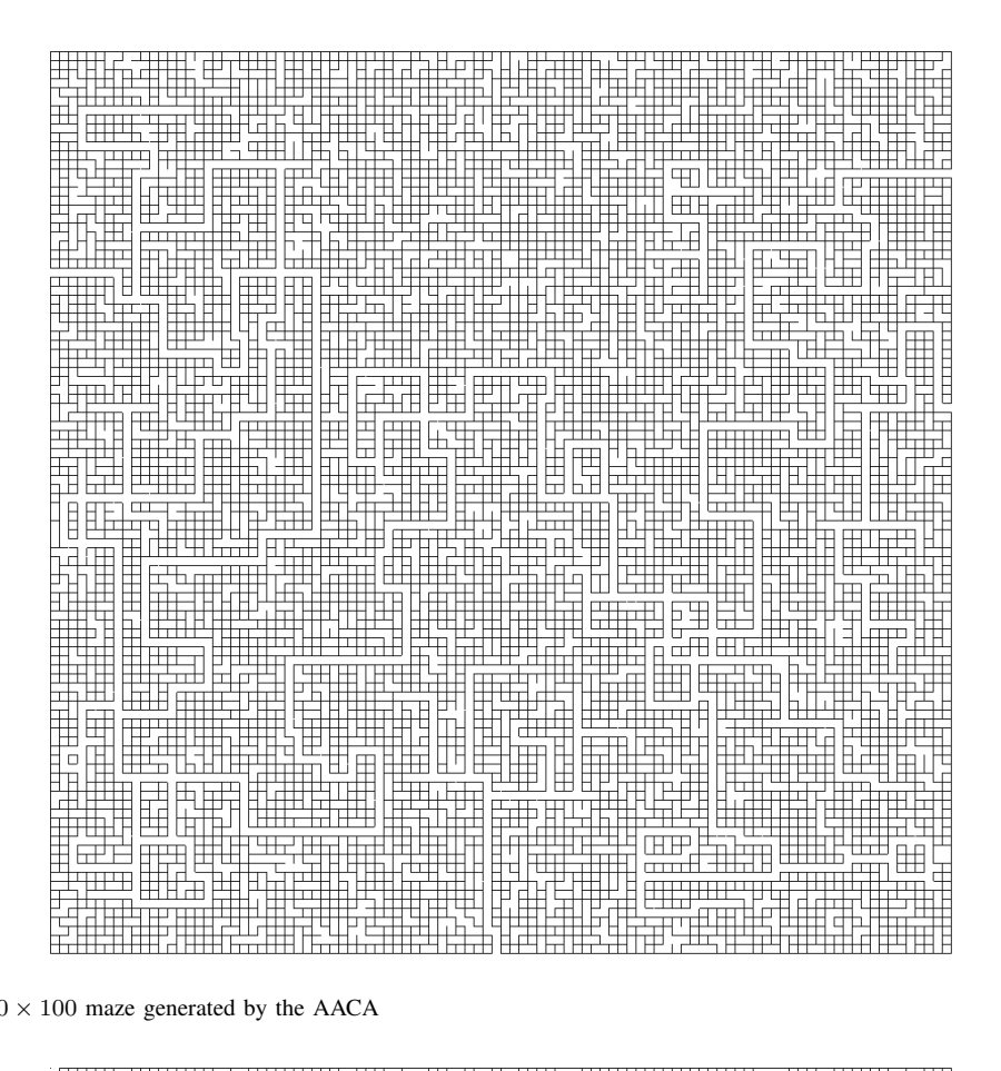
Fig. 3. An example of 100 \times 100 maze generated by the AACA