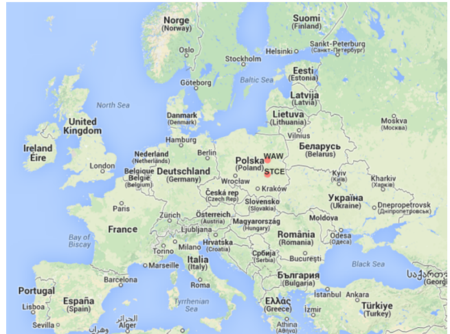
Fig. 1. Geographical location of ground stations